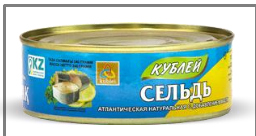
Atlantic herring with oil