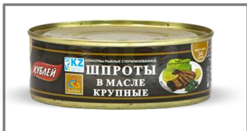
Large sprats in oil