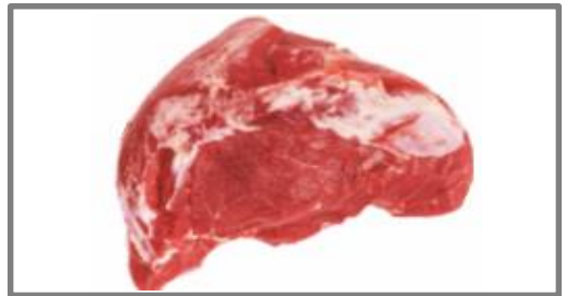
Shoulder blade cut