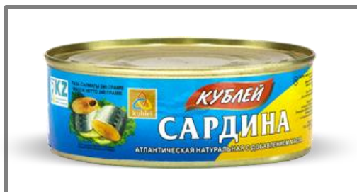
Atlantic sardine with oil