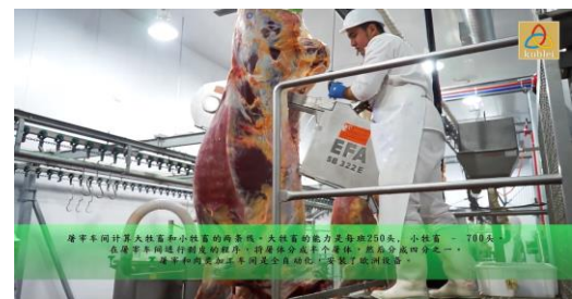
屠宰车间计算大牲畜和小牲畜的屠宰线。大牲畜的能力是每班250头，小牲畜 - 700头。 “Kublei” LLP 是肉类加工行业中的领导者，拥有最先进的设备。 “Kublei” LLP 是肉类加工行业中的领导者，拥有最先进的设备。