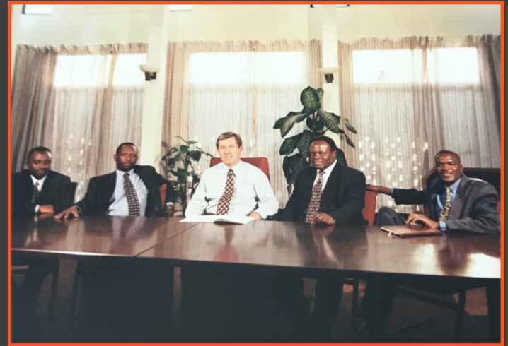
↑ PwC team sitting with the Zambia Sugar Managing Director and Finance Director then at the first PwC client cocktail.